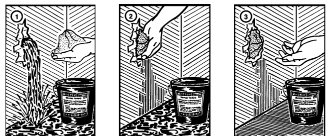
Leaks... ..stopped... ..in seconds!

We suggest using smooth rubber gloves when processing KÖSTER KD 2.